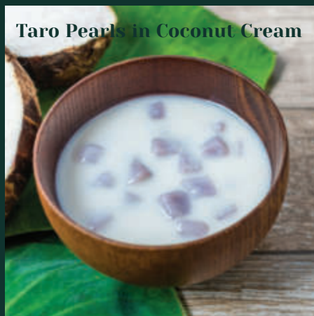
Taro Pearls in Coconut Cream