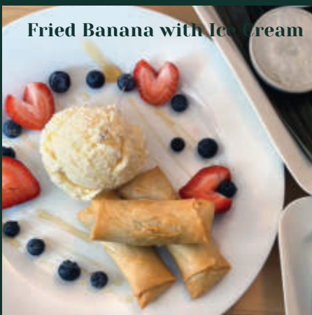
Fried Banana with Ice Cream