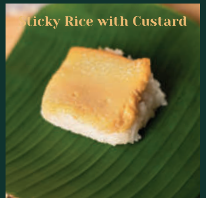
Sticky Rice with Custard